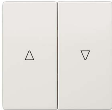
DELTA style, platinum metallic Rocker switch with shutter symbols for shutter switch and pushbutton 68x 68 mm