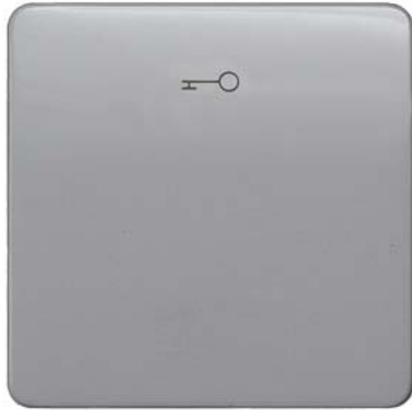
DELTA profil, silver Rocker switch with door opener symbol for pushbutton, 65x 65 mm