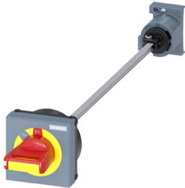
door-coupling rotary operating mechanism EMERGENCY OFF, size S00...S3 330 mm shaft