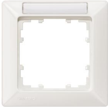
DELTA line, titanium white frame 1-fold, 80x 80 mm with labeling field