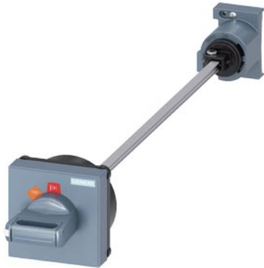
Door-coupling rotary operating mechanism For circuit breaker Size S00...S3, black 330 mm shaft