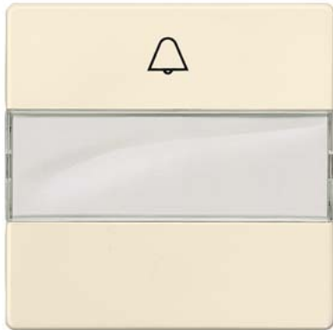
DELTA i-system electrical white Rocker switch with bell symbol and labeling field for pushbutton, 55x 55 mm