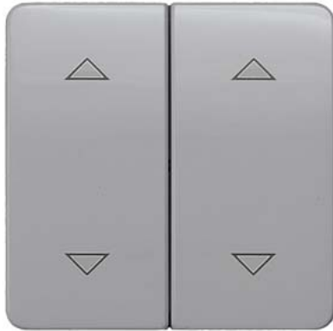
DELTA profil, silver Rocker switch with shutter symbols for pushbutton 2-fold Mid-position 65x 65 mm