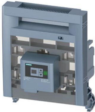
Handle unit with EFM25, for Size NH2, accessory for fuse switch disconnecter 3NP1