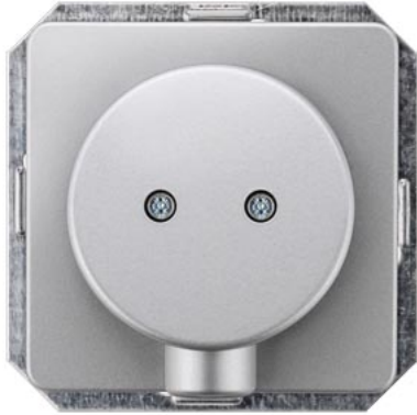
DELTA profil, silver Outlet plate 65x 65 mm