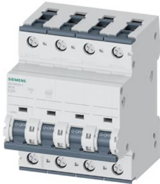
Miniature circuit breaker 400 V 6kA, 3+N-pole C, 20 A, D=70 mm