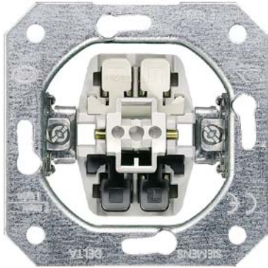
DELTA switch device insert FM, OFF/two-way switch without claws 10A 250V