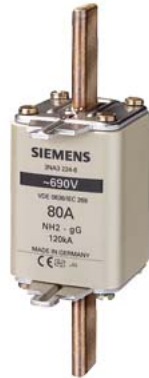
LV HRC fuse element, NH2, In: 80 A, gG, Un AC: 690 V, Un DC: 440 V, Front indicator, live grip lugs