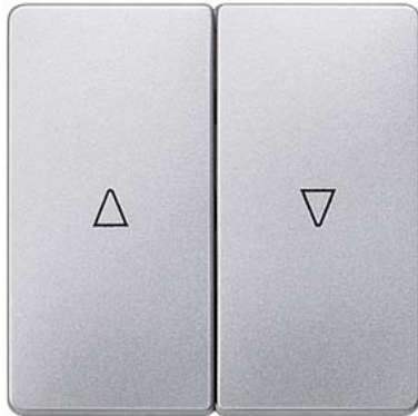
DELTA i-system aluminum-metallic Rocker switch with shutter symbols for shutter pushbutton, 55x 55 mm