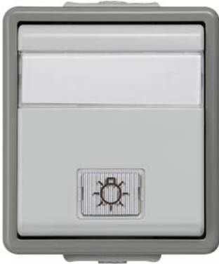
DELTA fläche IP44, AP Dark gray/light gray Two-way switch, 10A 250V with window, label, glow lamp 66x 75 mm