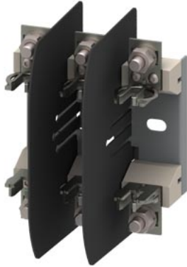
HRC fuse base ceramic Sz. 00 3-pole 160A 690V (1000V) flat terminal