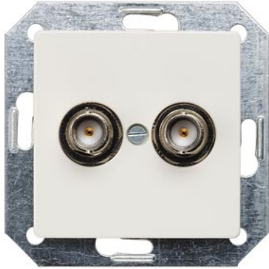
DELTA i-system titanium white BNC plug socket 2-fold, 75 ohm cover plate 55 x 55 mm