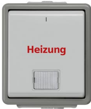
DELTA fläche IP44, AP Dark gray/light gray Heating switch, 2-pole 10A 250V, with pilot lamp 66x 75 mm