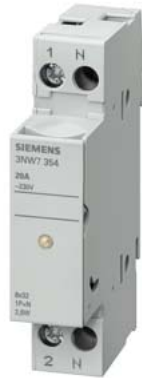
SENTRON, cylindrical fuse holder, 8x32 mm, 1P+N, In: 20 A, Un AC: 400 V, LED signal detector