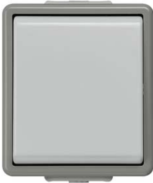
DELTA fläche IP44, AP Dark gray/light gray Intermediate switch, 10A 250V 66x 75 mm