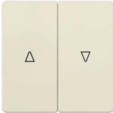
DELTA i-system electrical white Rocker switch with shutter symbols for shutter pushbutton, 55x 55 mm