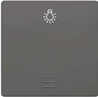
DELTA i-system carbon metallic Rocker switch with window with symbol light for pushbutton, 55x 55 mm