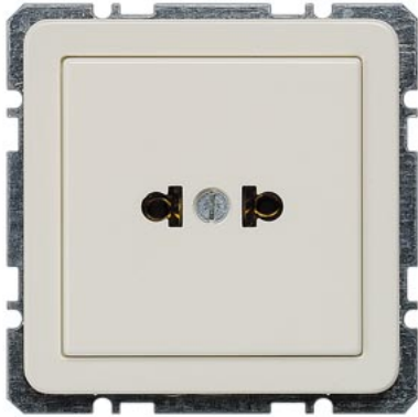
DELTA profil, titanium white Socket outlet 15A 125V American standard C73 Central plate 51x 51mm