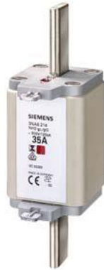
LV HRC fuse element, NH2, In: 100 A, gG, Un AC: 500 V, Un DC: 440 V, Combined indicator, Insulated grip lugs