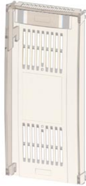
Replacement part for 3KF size 5 Fuse cover