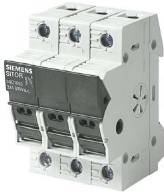
SITOR fuse switch 10x 38, Up to 32 A, 690 V AC, 3-pole