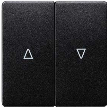
DELTA i-system carbon metallic Rocker switch with shutter symbols for shutter pushbutton, 55x 55 mm