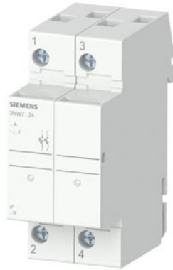
SETRON, cylindrical fuse holder, 8x32 mm, 2-pole, In: 20 A, Un AC: 400 V, LED signal detector