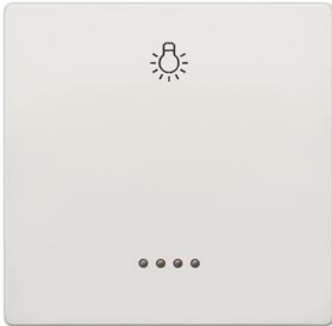
DELTA style, platinum metallic Rocker switch with window w. symbol Light for pushbutton, 68x 68 mm