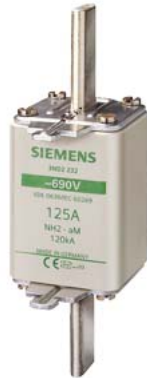
LV HRC fuse element, NH2, In: 125 A, aM, Un AC: 690 V, Un DC: 400 V, Front indicator, live grip lugs