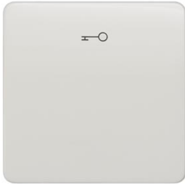
DELTA profil, titanium white Rocker switch with door opener symbol for pushbutton, 65x 65 mm