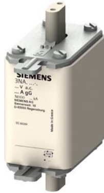
LV HRC fuse element, NH00, In: 63 A, gG, Un AC: 500 V, Un DC: 250 V, Front indicator, live grip lugs