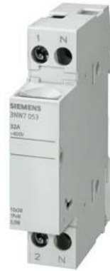
SENTRON, cylindrical fuse holder, 8x32 mm, 1P+N, In: 20 A, Un AC: 400 V