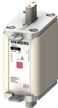
LV HRC fuse element, NH00, In: 160 A, gG, Un AC: 400 V, Combined indicator, insulated Grip lugs