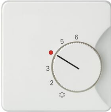
DELTA profil, titanium white Room temperature controller cover Normally-closed contact/change-over contact, 65x 65 mm