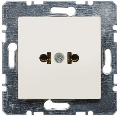
DELTA i-system titanium white Socket outlet 15A 125V American standard C73 Central plate 51x 51mm