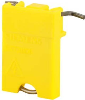
handle locking devices for 5SL, 5SV, 5TL1, 5SY17...