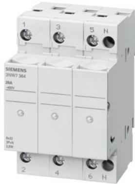
SENTRON, cylindrical fuse holder, 8x32 mm, 3P+N, In: 20 A, Un AC: 400 V, LED signal detector