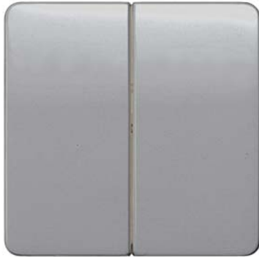
DELTA profil, silver Rocker switch, 65x 65 mm for series/double two-way switch for double pushbutton for pushbutton 2-fold Mid-position