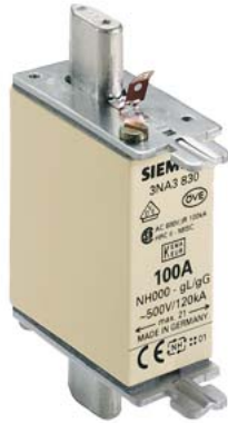
LV HRC fuse element, NH000, In: 100 A, gG, Un AC: 500 V, Un DC: 250 V, Front indicator, live grip lugs