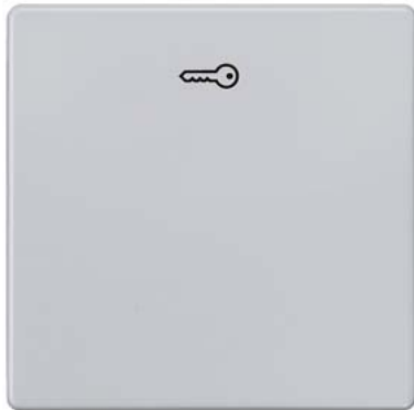
DELTA i-system aluminum-metallic Rocker switch with door opener symbol for pushbutton, 55x 55 mm