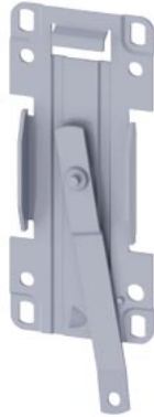
Accessory for position switch Motherboard