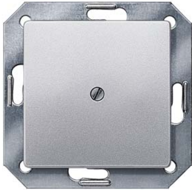
DELTA i-system aluminum-metallic blanking plate, 55x 55 mm