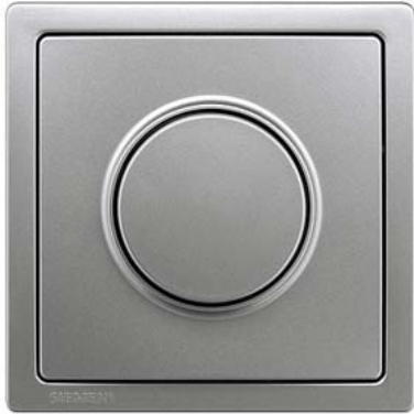
DELTA style, platinum metallic Cover plate for dimmer with rotary knob 68x 68 mm