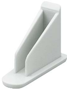
End cap 1-phase for pin busbars according to UL 508