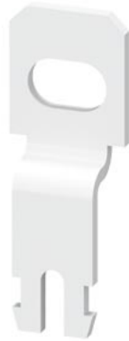
Push-in lug size S00/S0