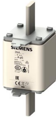
LV HRC fuse element, NH3, In: 300 A, gG, Un AC: 500 V, Un DC: 440 V, Front indicator, live grip lugs