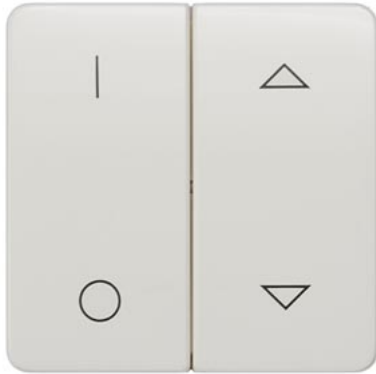
DELTA profil, titanium white Rocker switch with symbols I0 and Shutter for shutter switch, 65x 65 mm