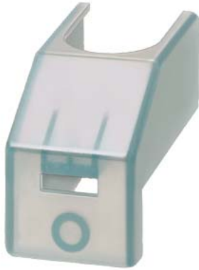
Terminal cover, 1-pole, for 63 A, accessory for main and emergency switching-off switch 3LD2