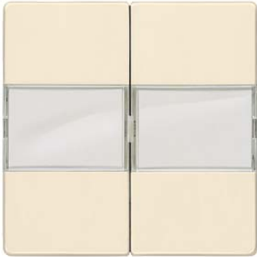
DELTA i-system electrical white Rocker switch with label for series/double two-way switch 55x 55 mm