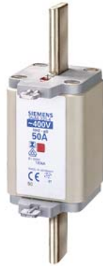
LV HRC fuse element, NH2, In: 50 A, gG, Un AC: 400 V, Combined indicator, insulated Grip lugs